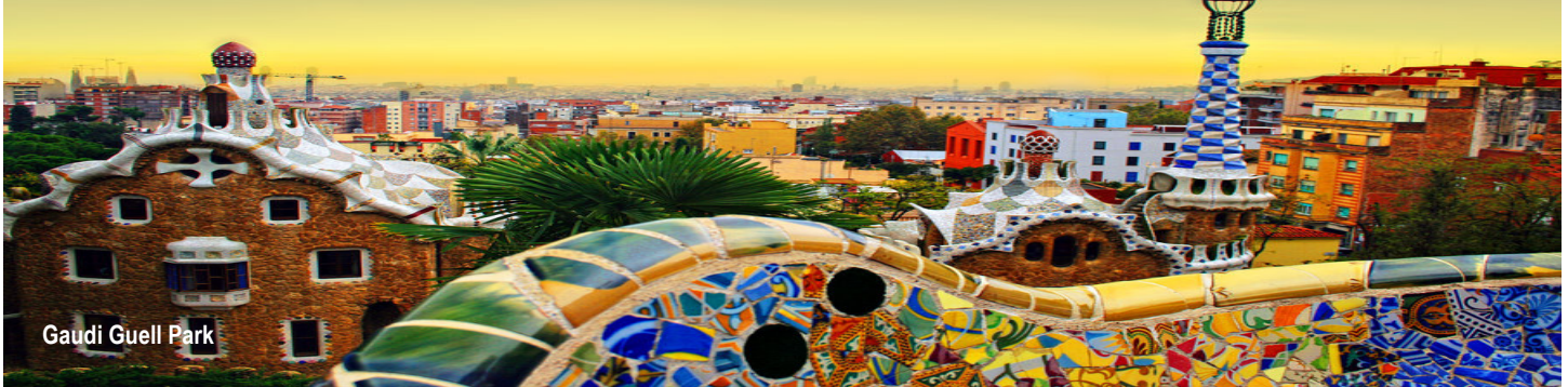
Gaudi Guell Park